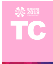
Transport for committee