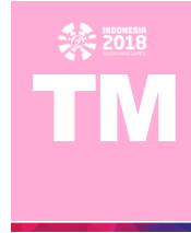
Transports services exclusively for media