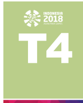
Free use of the public system