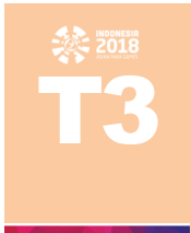
Access to a shared vehicle available with advanced notices