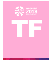
Transport services reserved exclusively for official