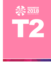
Two delegates car